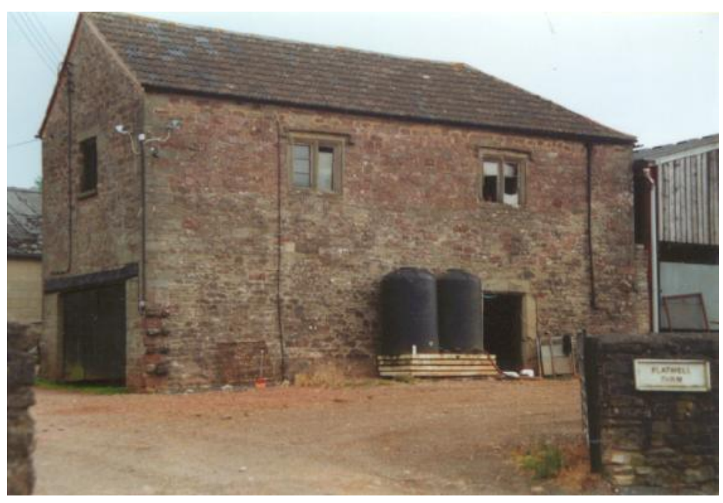
Platwell Farm 'carthouse', Clearwell - Originally a farmhouse that was replaced by a Georgian farmhouse, dates from seventeenth century.