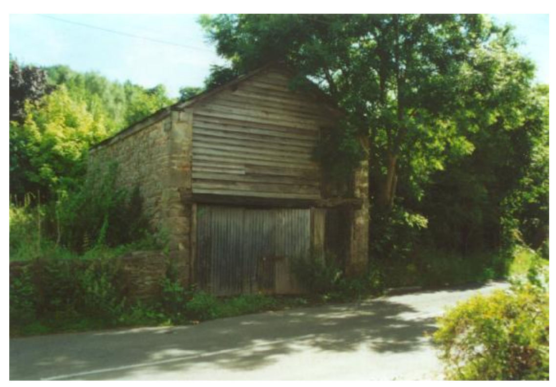
Horlick's Barn, Ruardean - The building where the Horlicks brothers are reputed to have carried out early experiments leading to successful drying of milk.