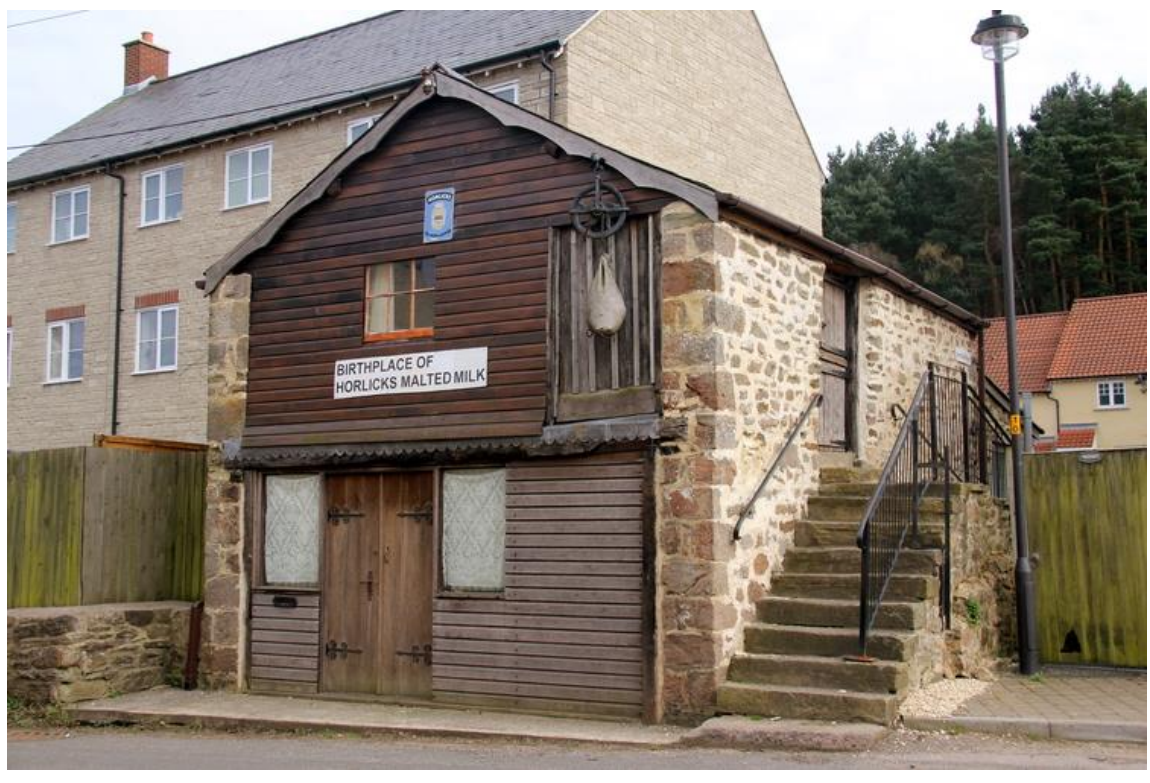
The renovated barn in 2010.

View direction - South Date taken - August 2000