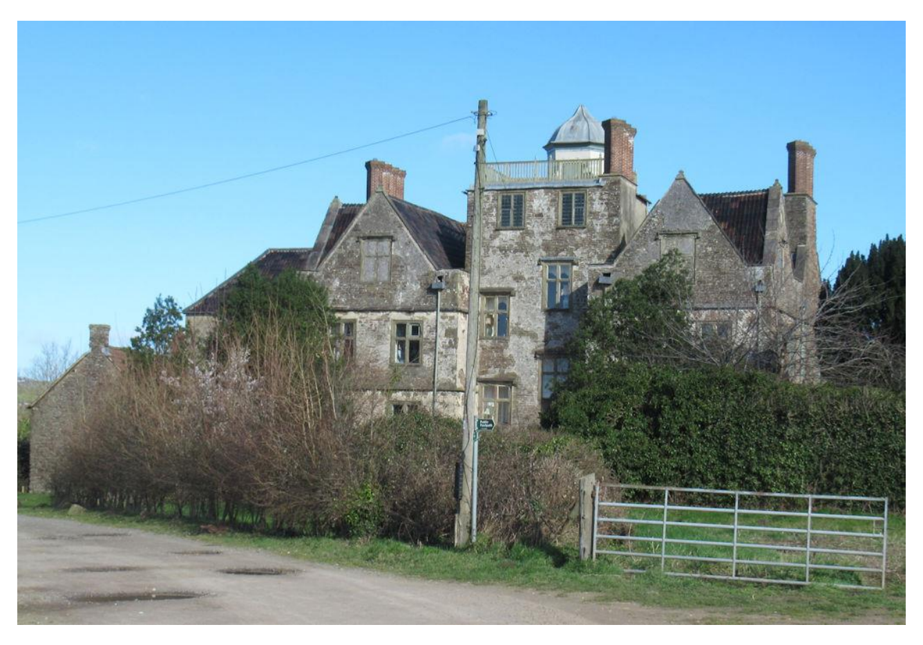
The owners have planted a hedge in front of the south side of the house, obstructing the view. However, the property appears to be in the same condition in 2022 as in 2010.