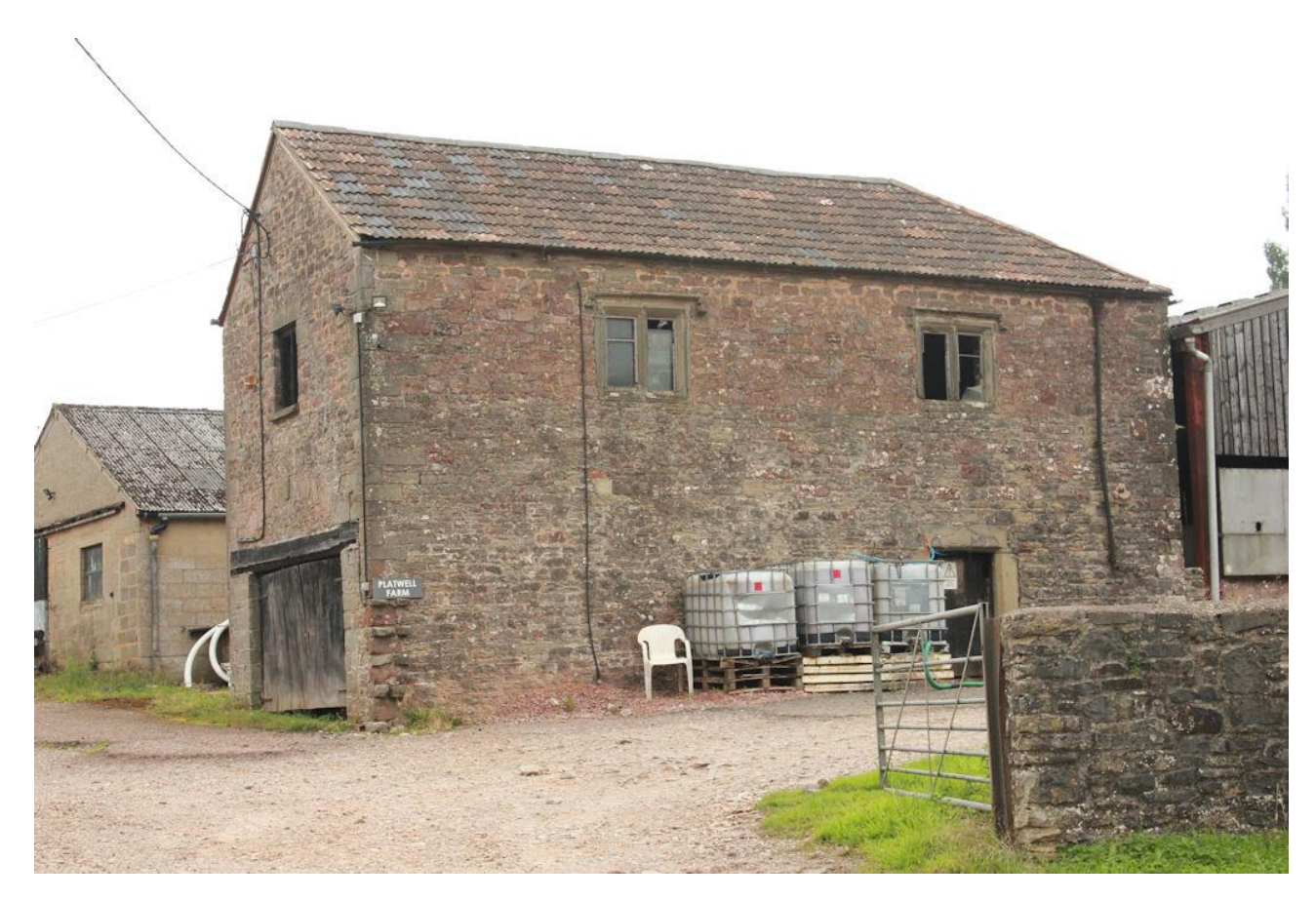
No discernible change in 2021.