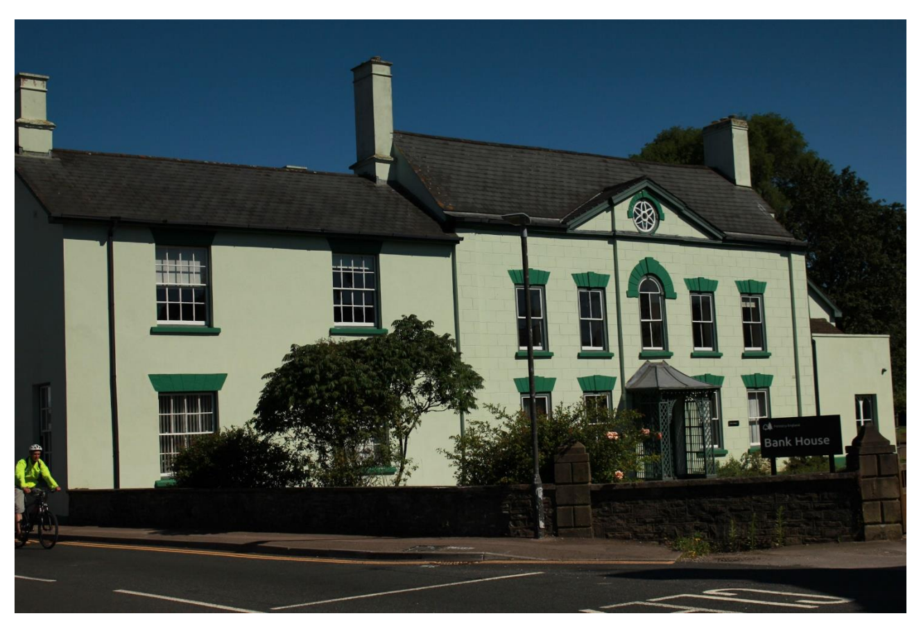
A new notice board is the only obvious change in 2021

Date taken – 13<sup>th</sup> June 2021