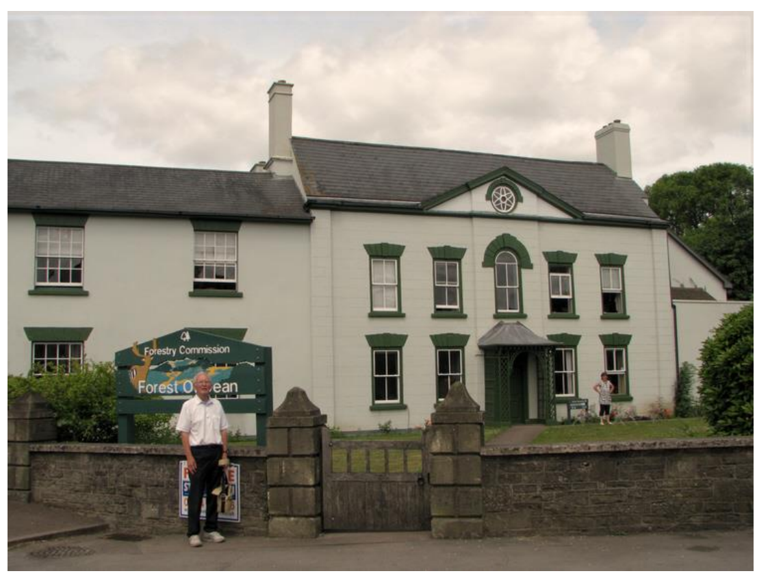
Little change apart from a new notice board and the need of the front gate for some treatment. Date taken - July 2010

View direction - North East Date taken - June 2000