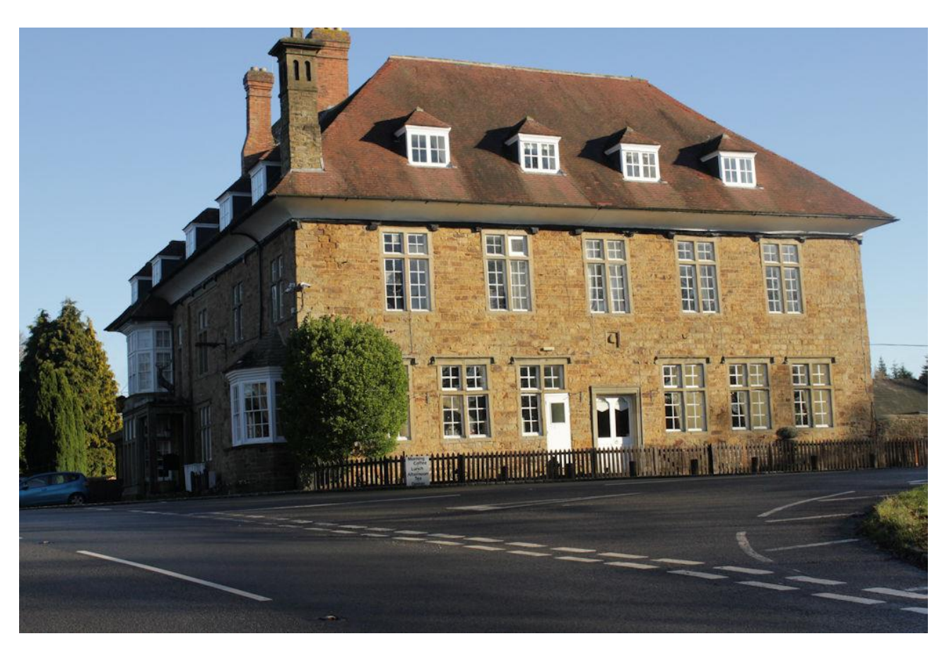
The hotel retains its status as the premier hotel of the Forest area and is well maintained.

Date taken – 20<sup>th</sup> December 2023