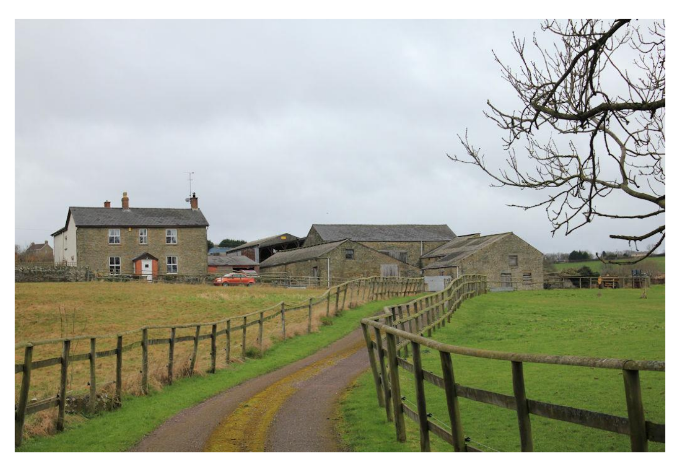
No change since 2010.