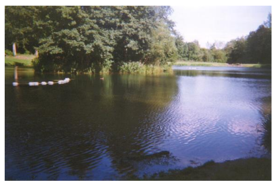
Clanna Pond - Laid out by Noel family, c1820, as ornamental lake and fish ponds, probably on site of former forge ponds. Enlarged and landscaped by W.B.Marling after 1880. Estate dispersed 1954, now owned by Forestry Commission and let for fly-fishing.