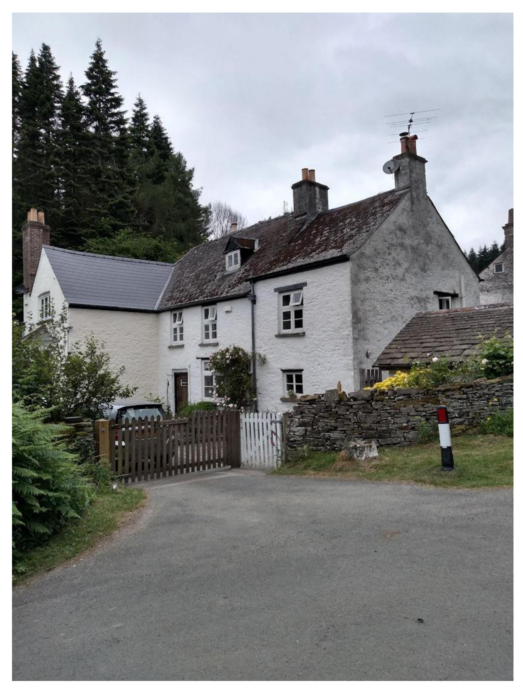
Few changes since 2010.