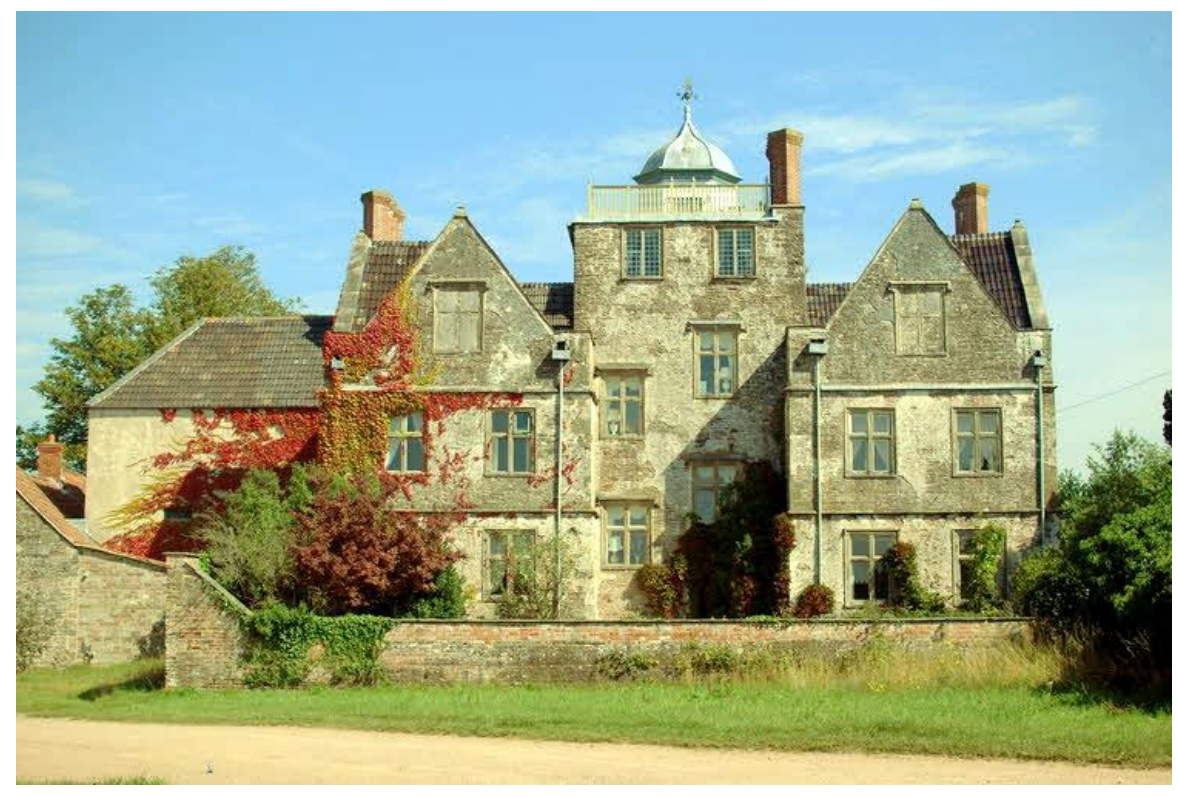
This view is taken from the opposite direction and shows the south face of the house post restoration. Date taken - September 2010

View direction - South Date taken - August 2000