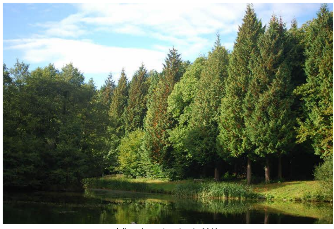
A first alternative view in 2010.

View direction - East South East Date taken - August 2000