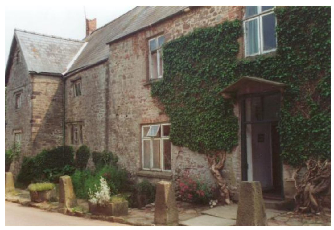
Spout Farm, Newland - Oldest part is the central part, dates from c1500. Newland Parish

Camera location - SO553097