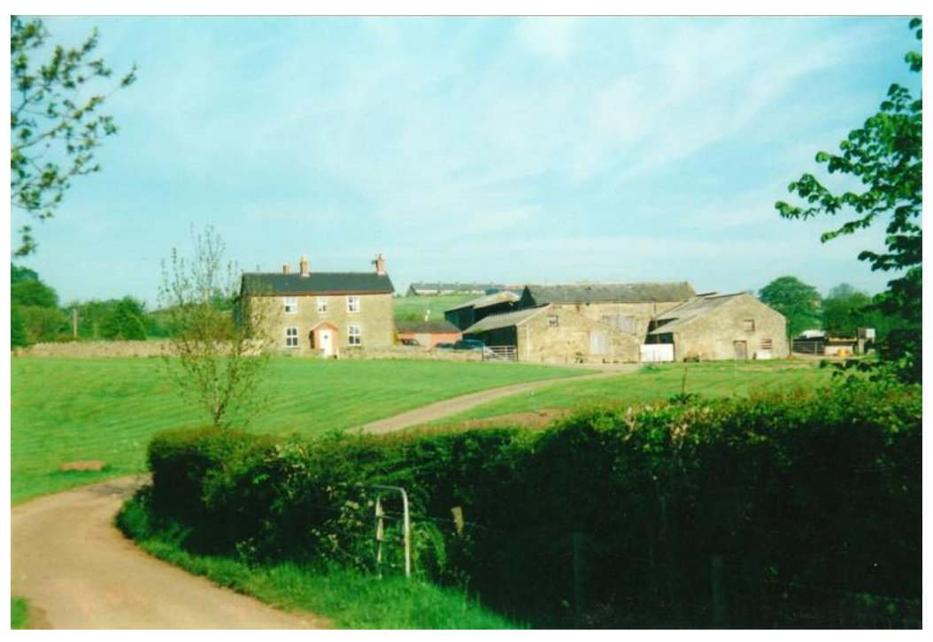
Poolway Farmhouse is close to the site of the King's Pool, which probably dates from the 13th Century. The present building dates from the mid19th Century, although it replaced an earlier building. Coleford Parish

Camera location - SO581112