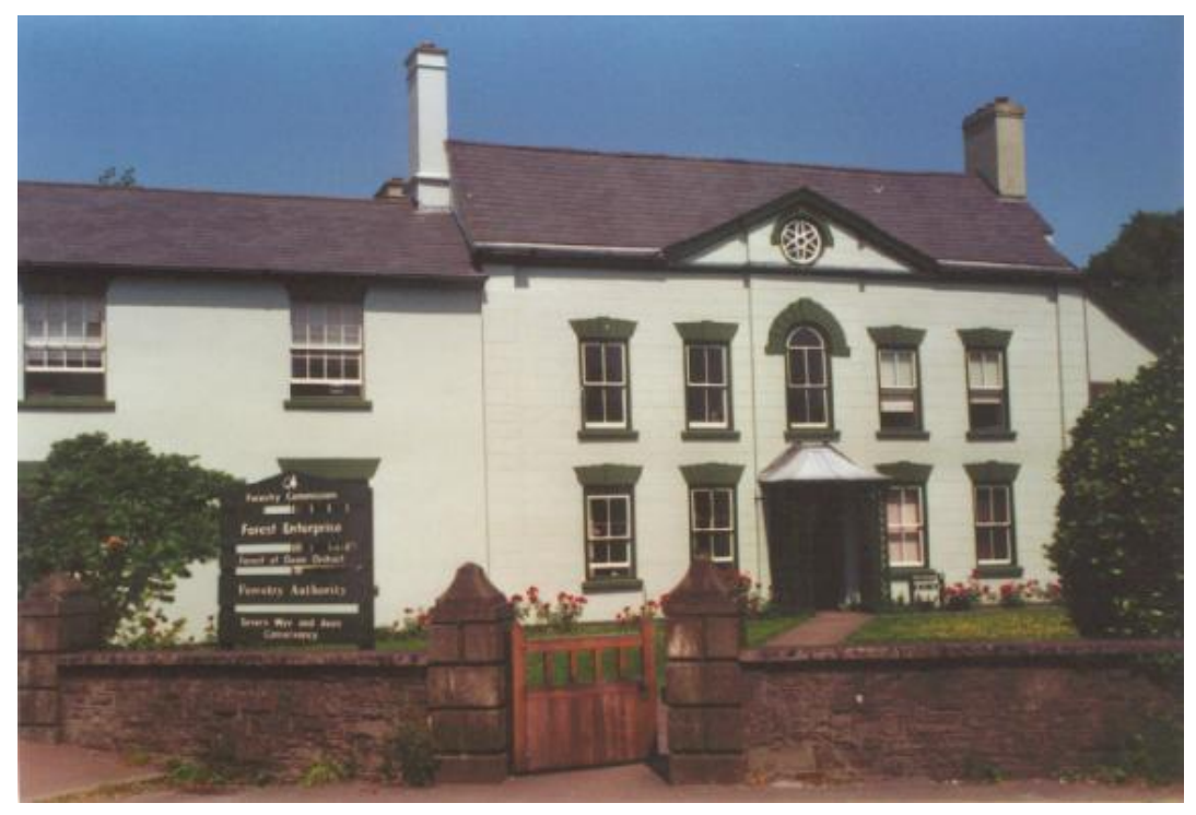
Bank House, Coleford - Built in 1786. Home to Forest Enterprise and Deputy Gaveller. Coleford Parish

Camera location - SO576108