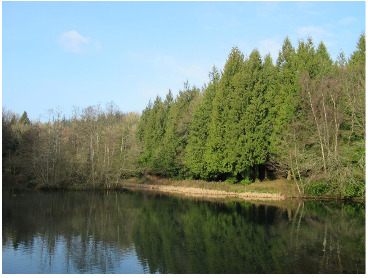
By 2022 some changes have been made but these photographs show that some views remain clear. \text{Date taken} - 26^{\text{th}} \text{ January 2022}