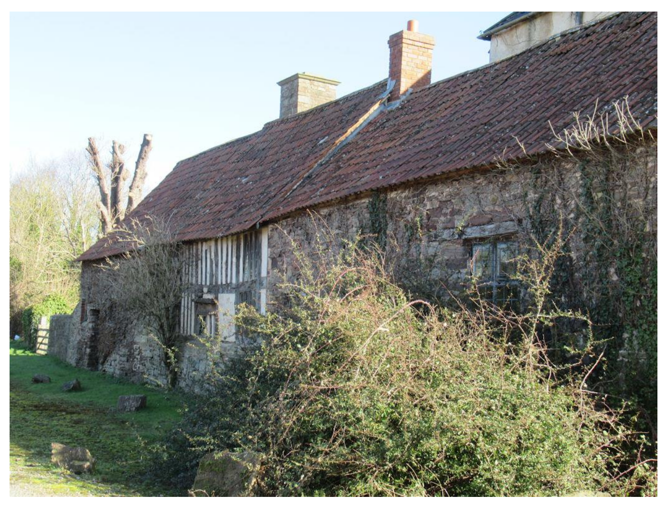
Little change since 2010, although vegetation is growing, including ivy climbing the walls of the structure. Date taken - 25<sup>th</sup> February 2022