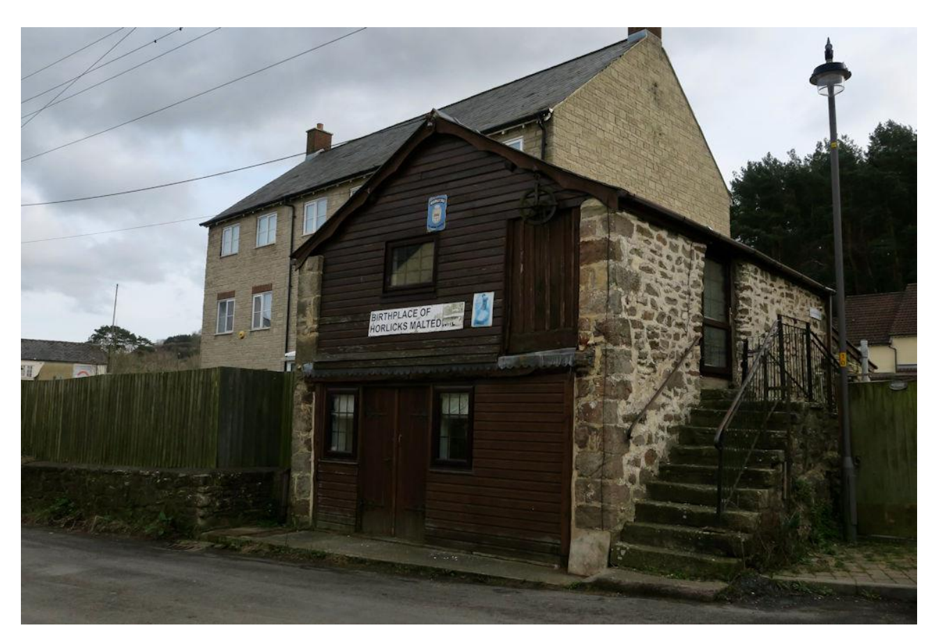
As improved in 2010.