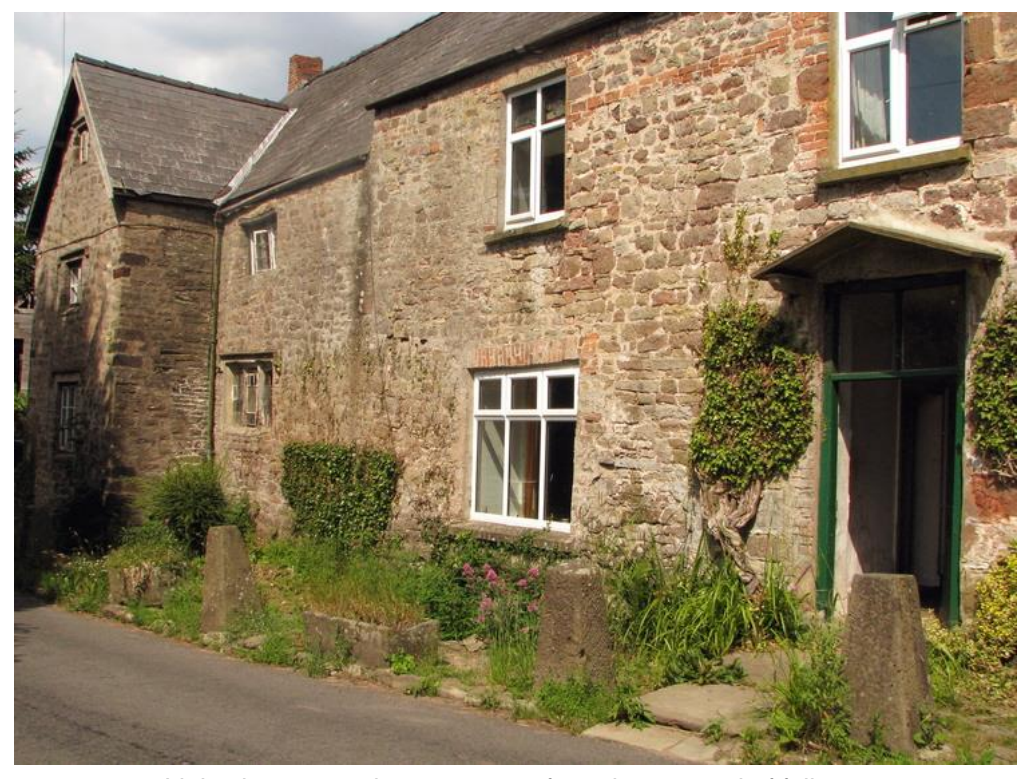
Little change can be seen apart from the removal of foliage.

View direction - North West Date taken - June 2000