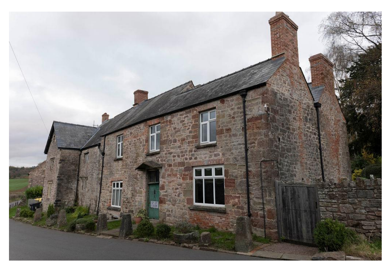
The farmhouse continues to be well maintained in 2021.

Date taken – 19<sup>th</sup> November 2021