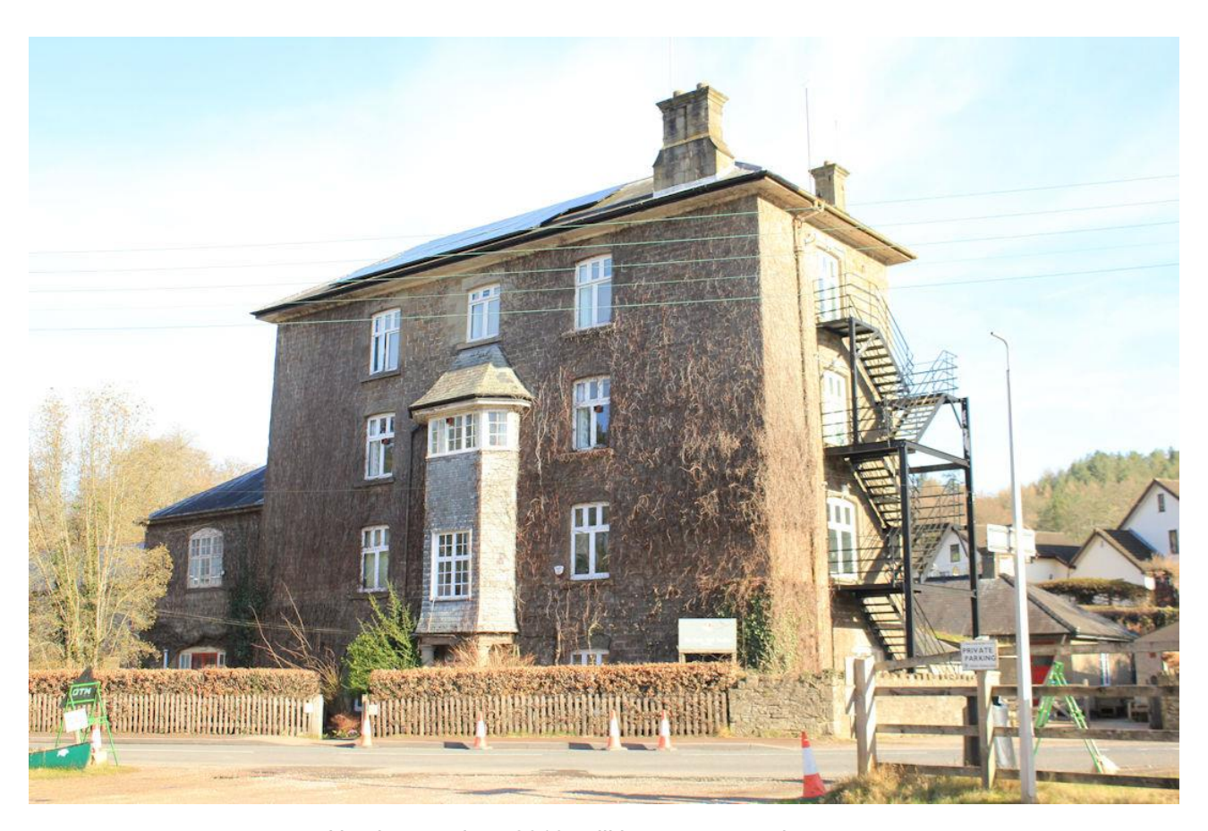
No change since 2010, still in use as a study centre.

Date taken – 17<sup>th</sup> February 2022