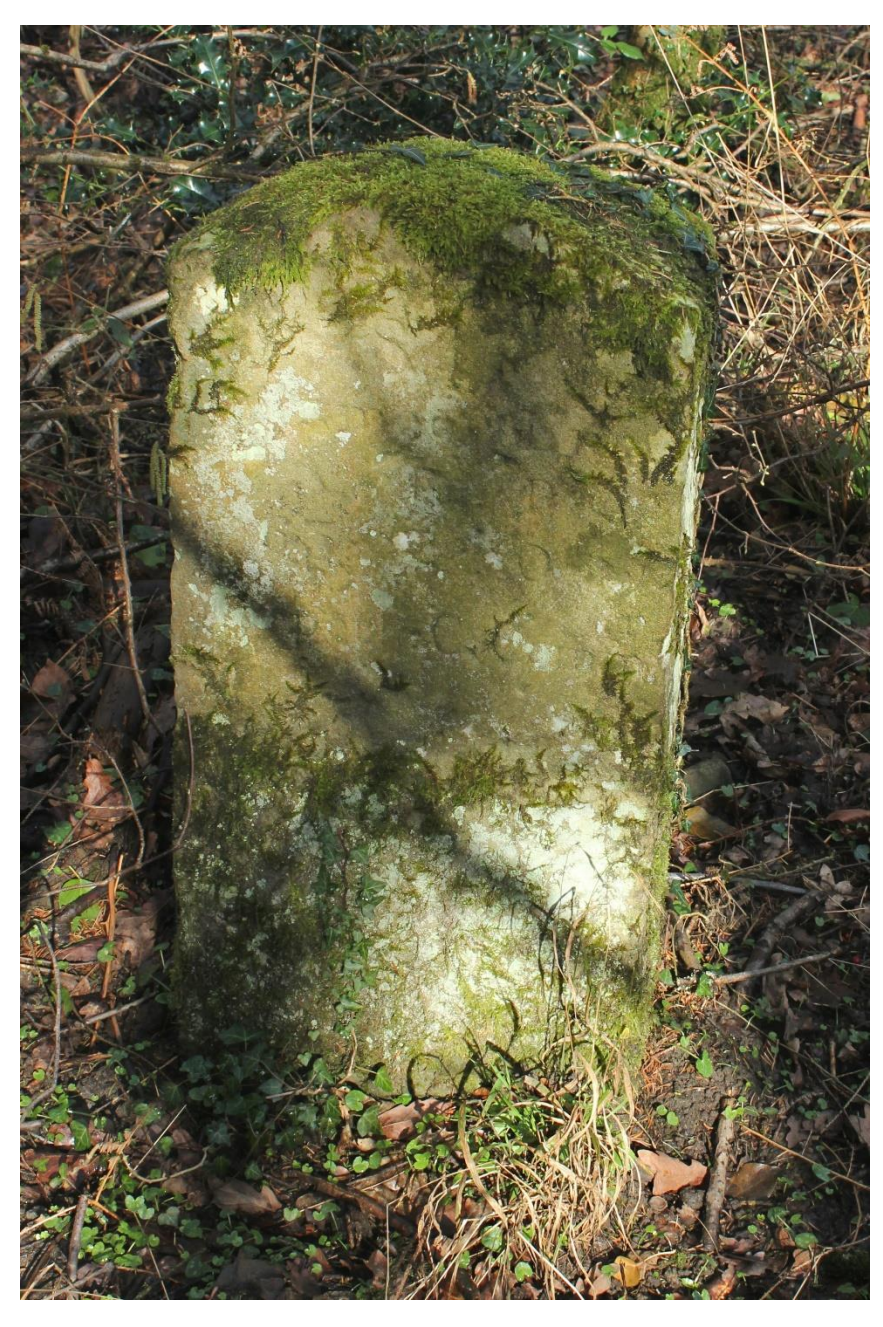
The inscription has much deteriorated.