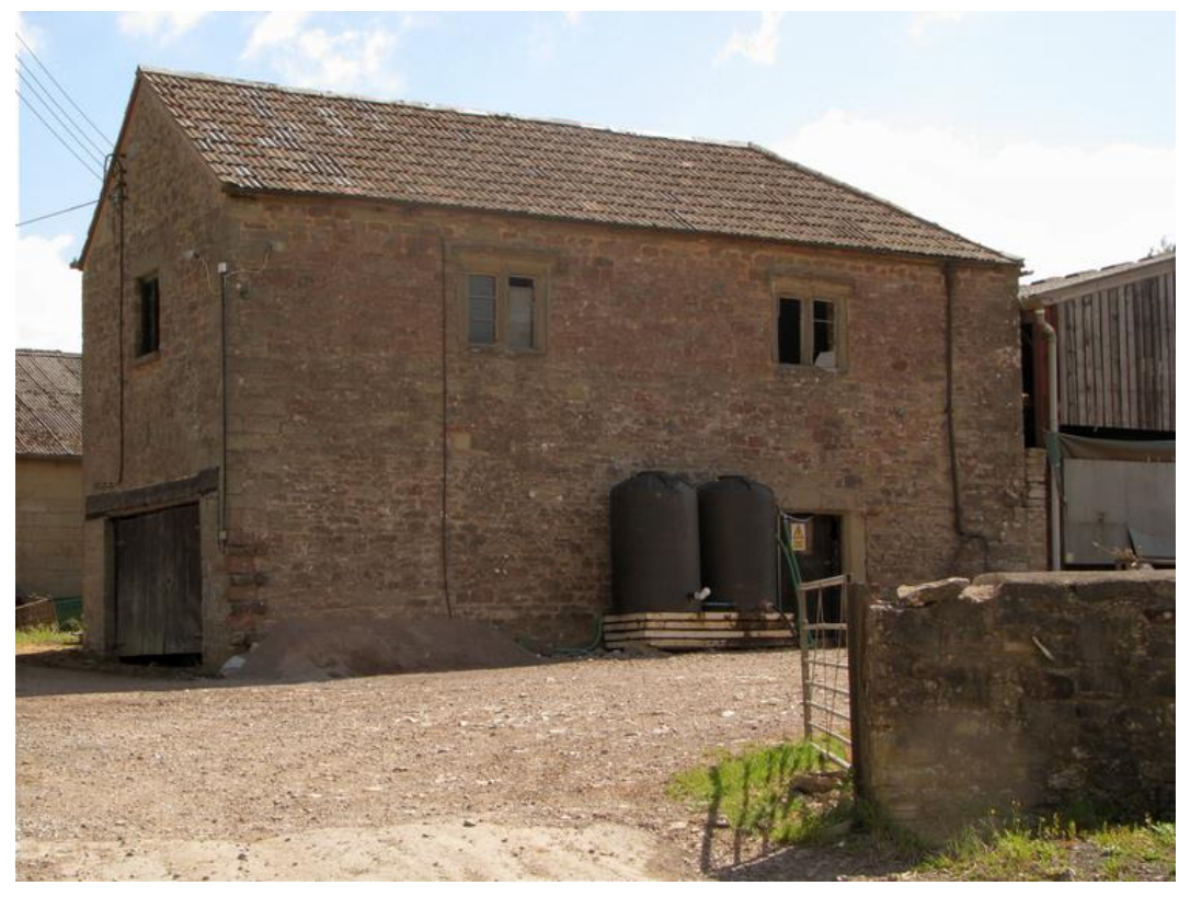
Nothing has changed.

View direction - East Date taken - June 2000