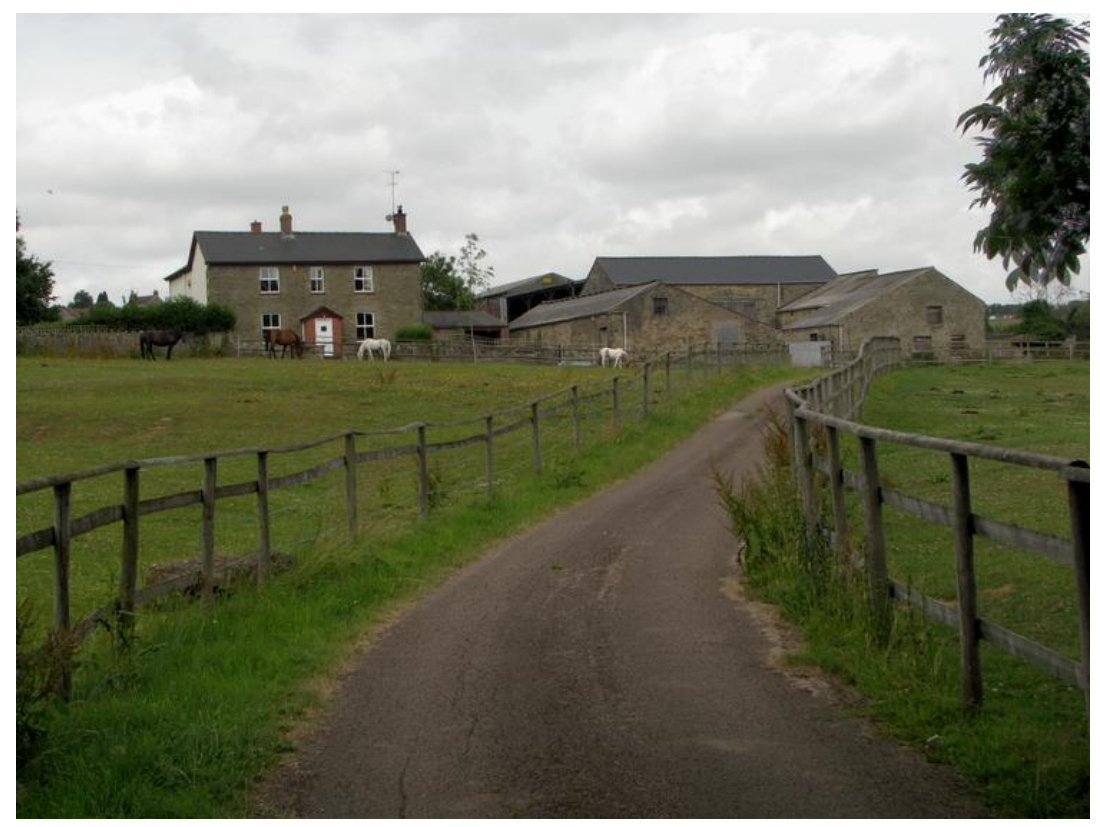
Some additional fencing has appeared, there has been little change to the building exteriors. Date taken - July 2010

View direction - West North West Date taken - May 2000