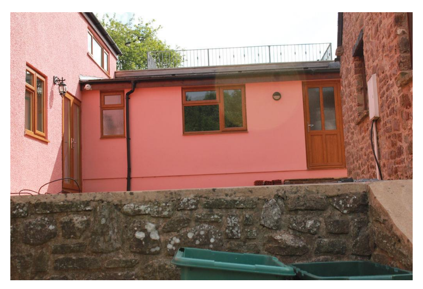
The "historic" features have been lost by modern alterations.

Date taken – 26<sup>th</sup> August 2021