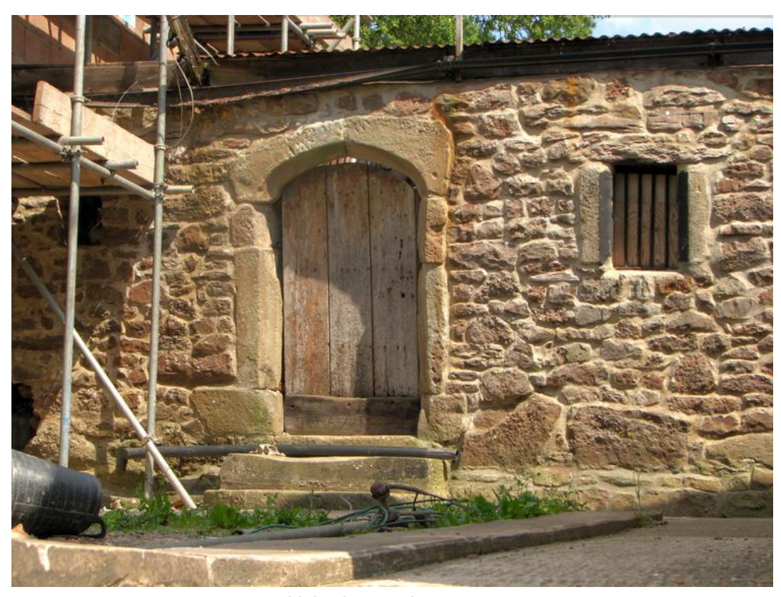
Little change since 2000.

View direction - East South East Date taken - June 2000